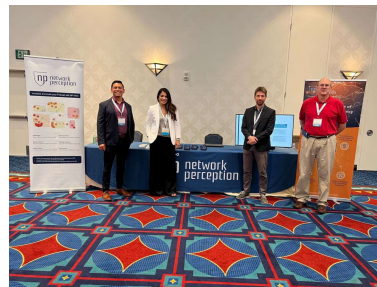
7.21: NP team attend EnergySec Con in Anaheim, CA