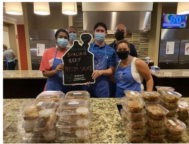
8.8: NP Team volunteering at the Chicago Ronald McDonald House Charity