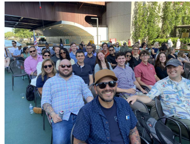
7.15: Network Perception team enjoys the Chicago Architecture Tour